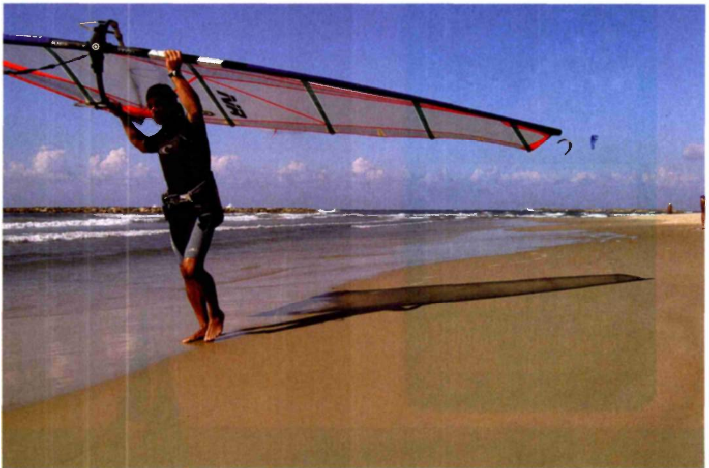
Pristine surroundings Palmachim

The beach Head to the popular Mineral Beach , whose fee includes changing rooms, showers, lounge chairs, a snack bar, umbrellas and a lifeguard as well as the added bonus