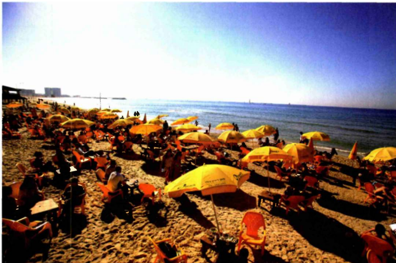
Sunny side up Israel's beaches usually come prepared with chairs and sun umbrellas