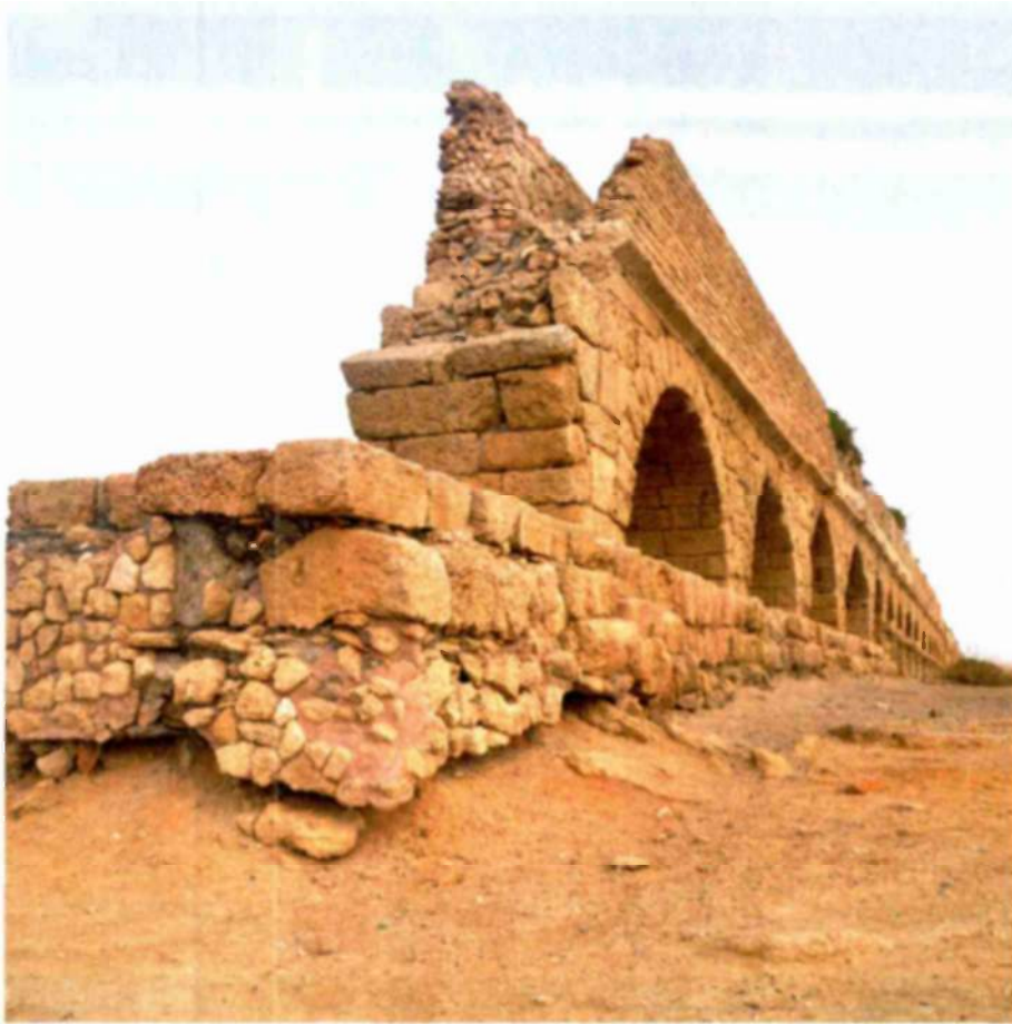
Scenic sunbathing Aqueduct Beach in Caesarea

Those in the mood to escape the crowds will want to try the more serene beach at Sidna Ali , just south of the archaeological site Apollonia. Lined by towering rocky cliffs and framed by a 13th-century mosque, Sidna Ali feels miles away from the rest of commercial Herzliya.