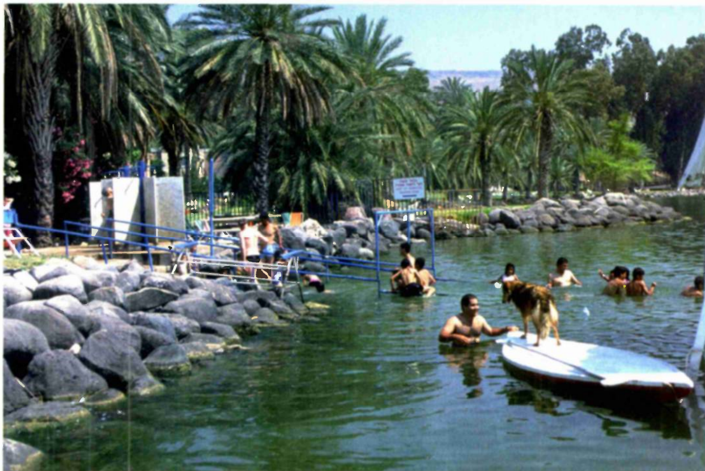
Take to the lake Kinneret's Tsemach beach

of a hot mineral pool great for soaking tired muscles. Massages are also available for an extra fee.